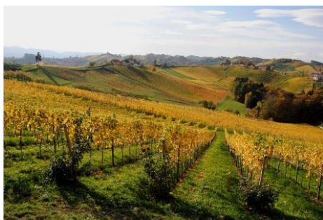
Vineyards near Leibnitz

IPA Austria's annual 'IPA Event' has become a much-loved tradition since its inauguration in the year 2000. The national board of IPA Austria selects an IPA event from the numerous gatherings organised by the regions and branches, and gives it the name of 'IPA Event'. In this way, a recommendable regional event can be promoted efficiently both nationally and internationally.