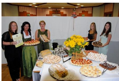
the gorgeous pastry buffet