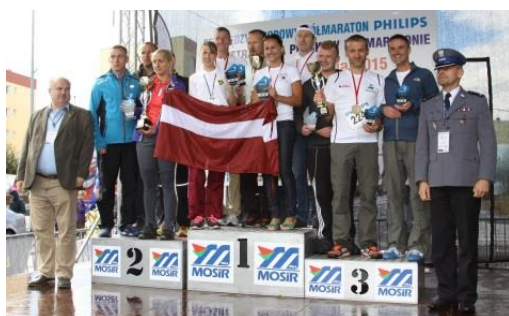
The winning team from IPA Latvia

In September 2015 IPA Poland organised a half-marathon competition for the Cup of the Chief Commander of the Polish Police. This event formed part of the 25 th international half-marathon 'Philips' in Pila, the town where the Polish police school for crime-investigation officers is located. More than 3000 runners participated, amongst them 152 police officers